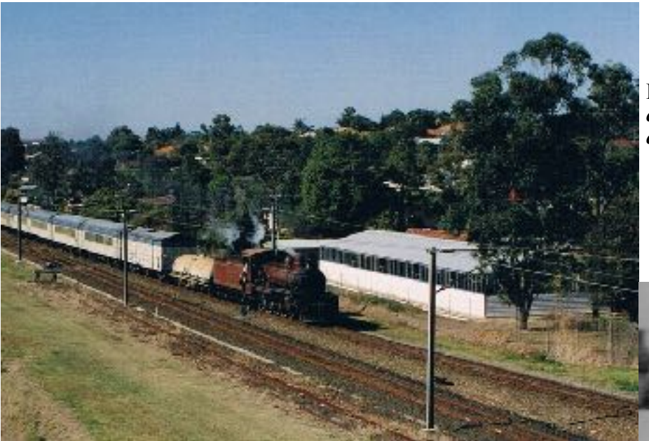
Left: C17 number 974, working a rake of AC cars north past AMRA's partially competed clubrooms.